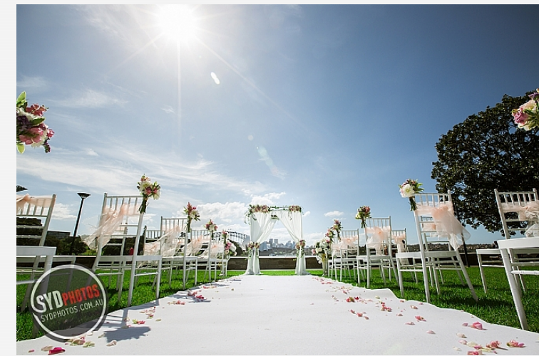
#5 Royal Botanic Gardens