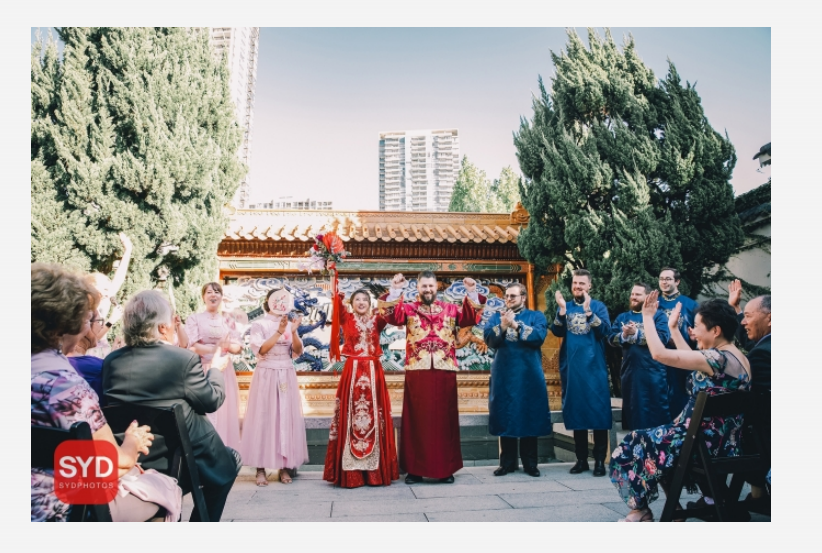
#9 Chinese Garden Of Friendship