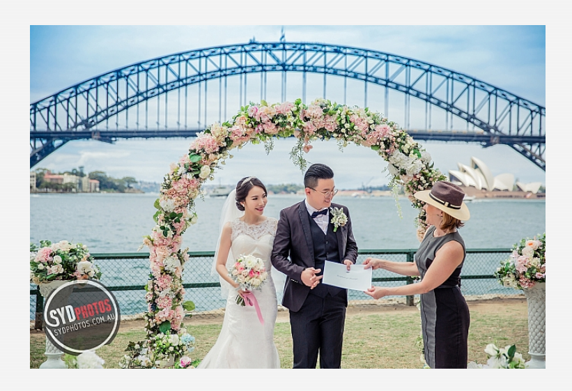
#4 Blues Point Reserve

\mathsf{VIEW}\;\mathsf{MORE}\;\mathsf{\to}\;