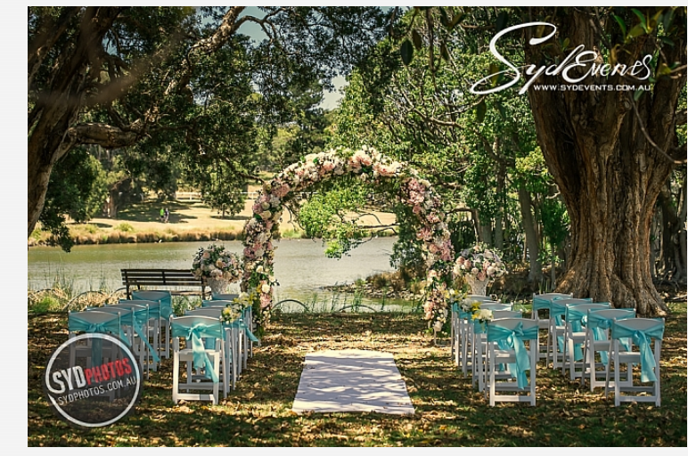
#8 Centennial Park