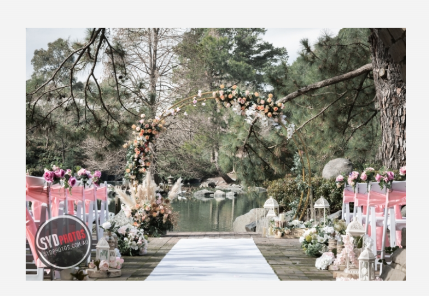
#10 Japanese Garden