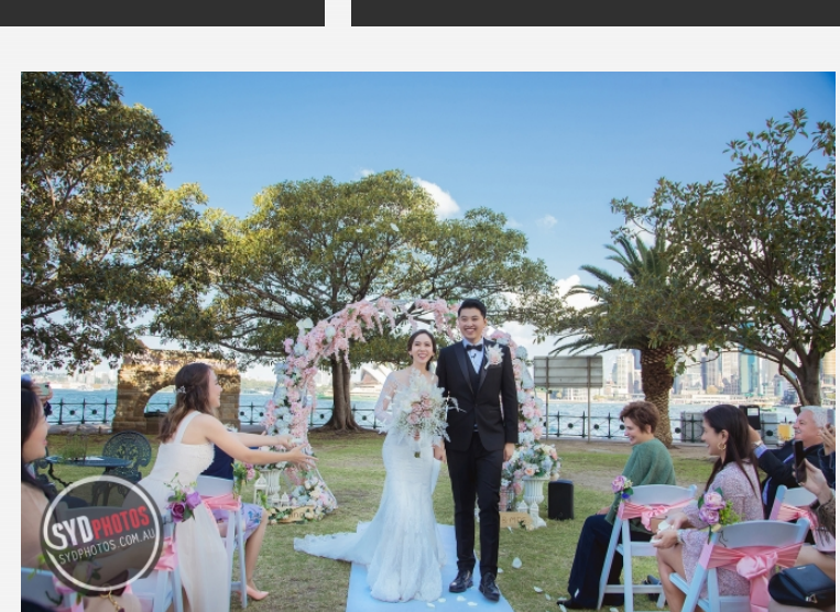
#2 Broughton Street Lookout (Kirribilli)