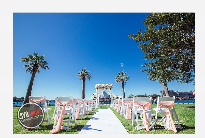
#6 Hickson Road Reserve