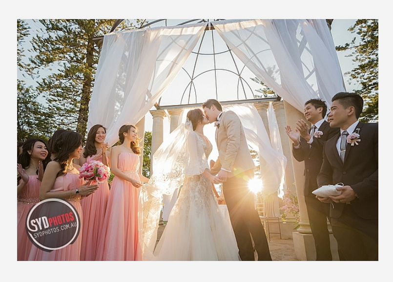
#7 Curzon Hall (Ceremony)